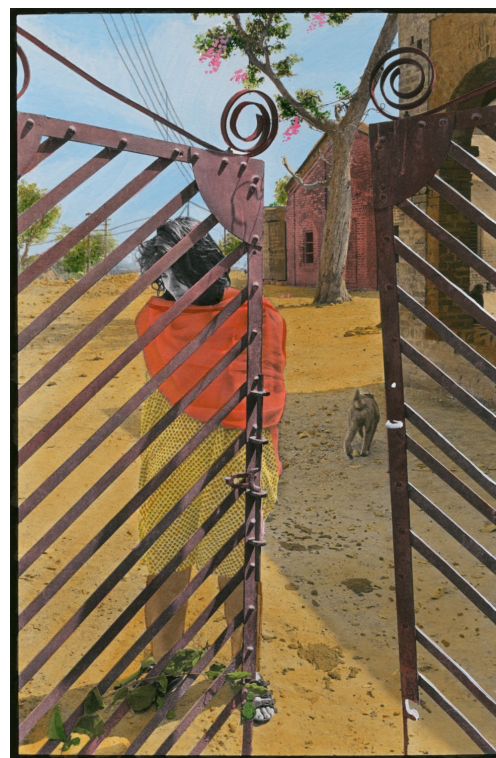
Pamela Singh Treasure Map 024 , 2015 Painted Archival Digital Print

Photographic elements including shadow and inverted silhouettes feature as additional characters in her visual narrative. Branches and leaves used to hide faces in one image reappear as ghost silhouettes in others. Arms and eyes break through or peek through the brown paper and white scrim. The use of these elements as simultaneous metaphors for canvas or shield, in tandem with an array of dried and collected chicken wishbones, lead the viewer to make connections between the ideas of "traditional" portraiture and of hope and wishes in an uncertain future.